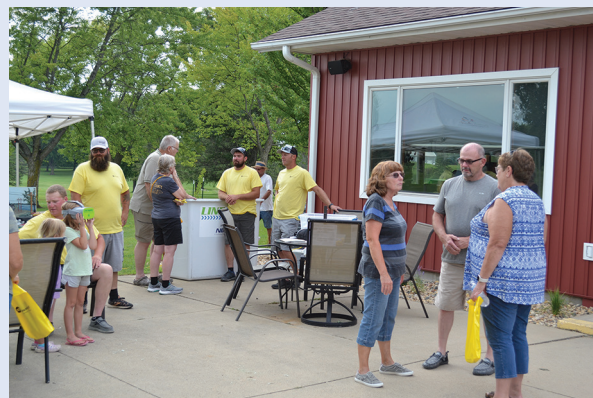
Members and line crew gather outside of the Butler County REC event in Tripoli.