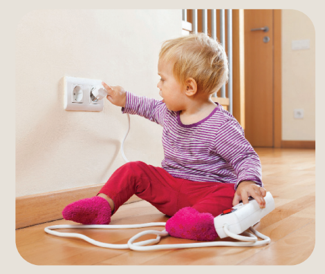
If you have young children, plug wall outlets with child-safety caps.

Start with a self-audit of your home—something you should turn into an annual ritual. Check that all of your appliances are still in working order by turning them on and off, listening to the sound of the motor (is