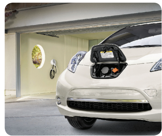
Nissan's Leaf, an electric car

These certifications, through the National Rural Electric Cooperative Association, help your directors understand their role and responsibilities and stay up-to-date on the industry. Directors take courses at each level to earn the certification.